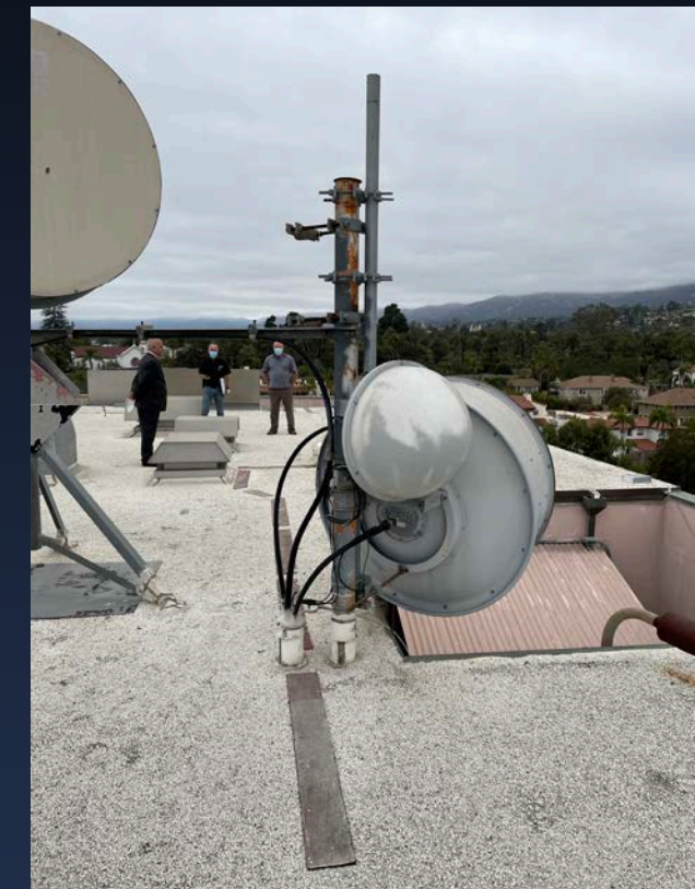
Microwave Backhaul Land Mobile Radio