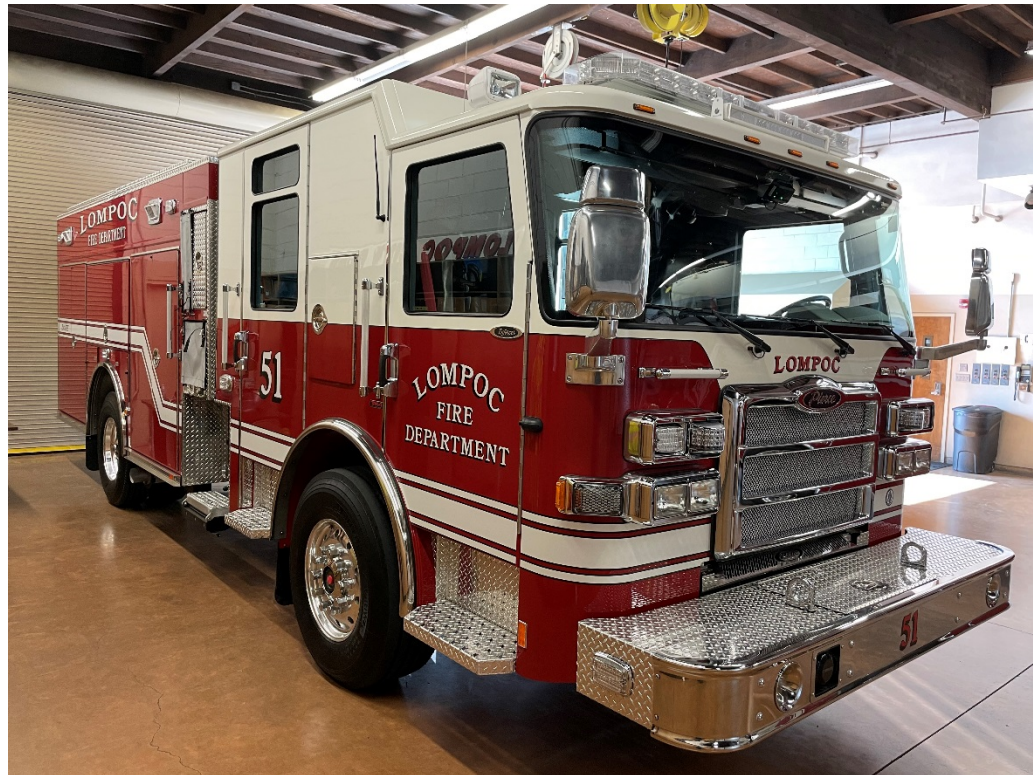
2021 Pierce Engine 51