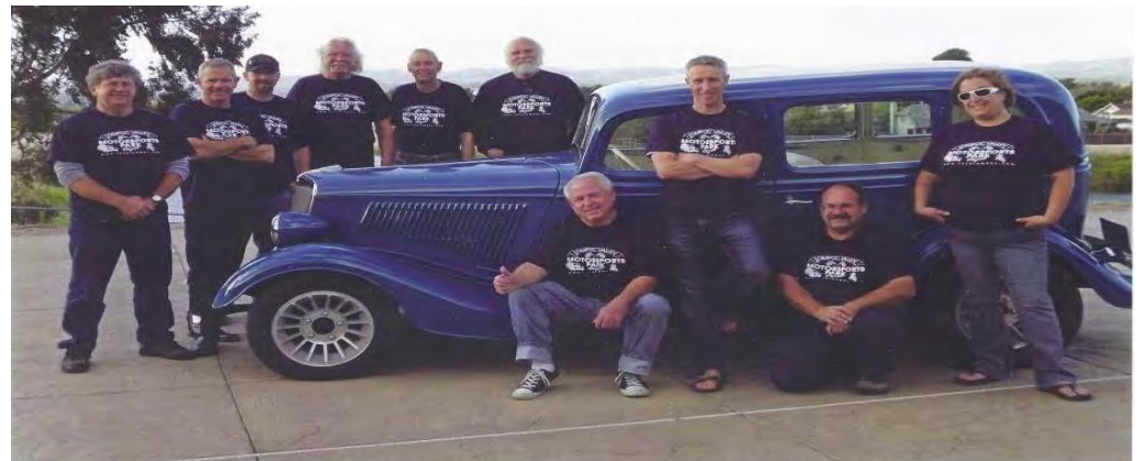
LOMPOC VALLEY MOTORSPORTS PARK COMMITTEE