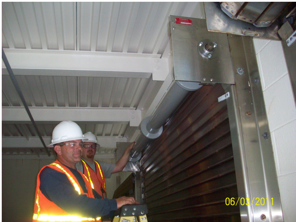
Storage 137 – Installing New Rollup Door Spring Barrels and Door Hardware