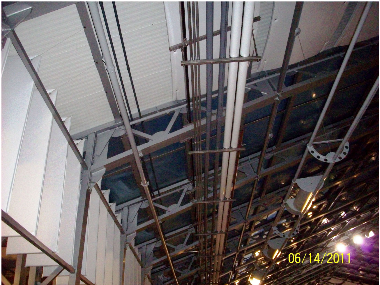
Pool Enclosure – Pipe Hangers with Conduit & Plumbing Piping

CONTRACTOR: Brannon Inc. dba Smith Electric Service ARCHITECT: Ravatt Albrecht & Associates, Inc. CONSTRUCTION MANAGER: Bachini-Deferville Management, Inc.