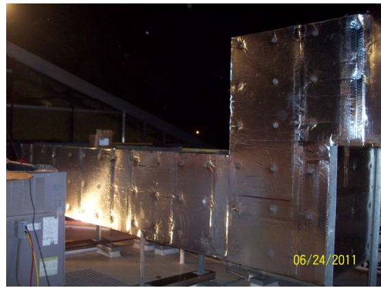
Roof – Installing Insulation on Ductwork for Air Handlers 3 and 4

Total No. of Submittals to Date: 72 No. of Submittals under Review: 06