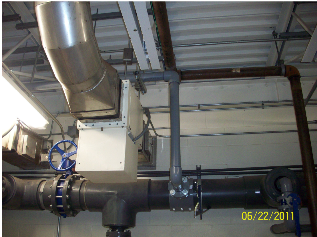
Mechanical Room 109 – Connected (N) Pool Water Line to (E) Activity Pool Return Line