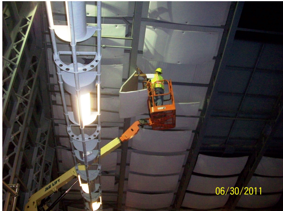
Pool Enclosure – Replacing Damaged Sound Suppression Panels