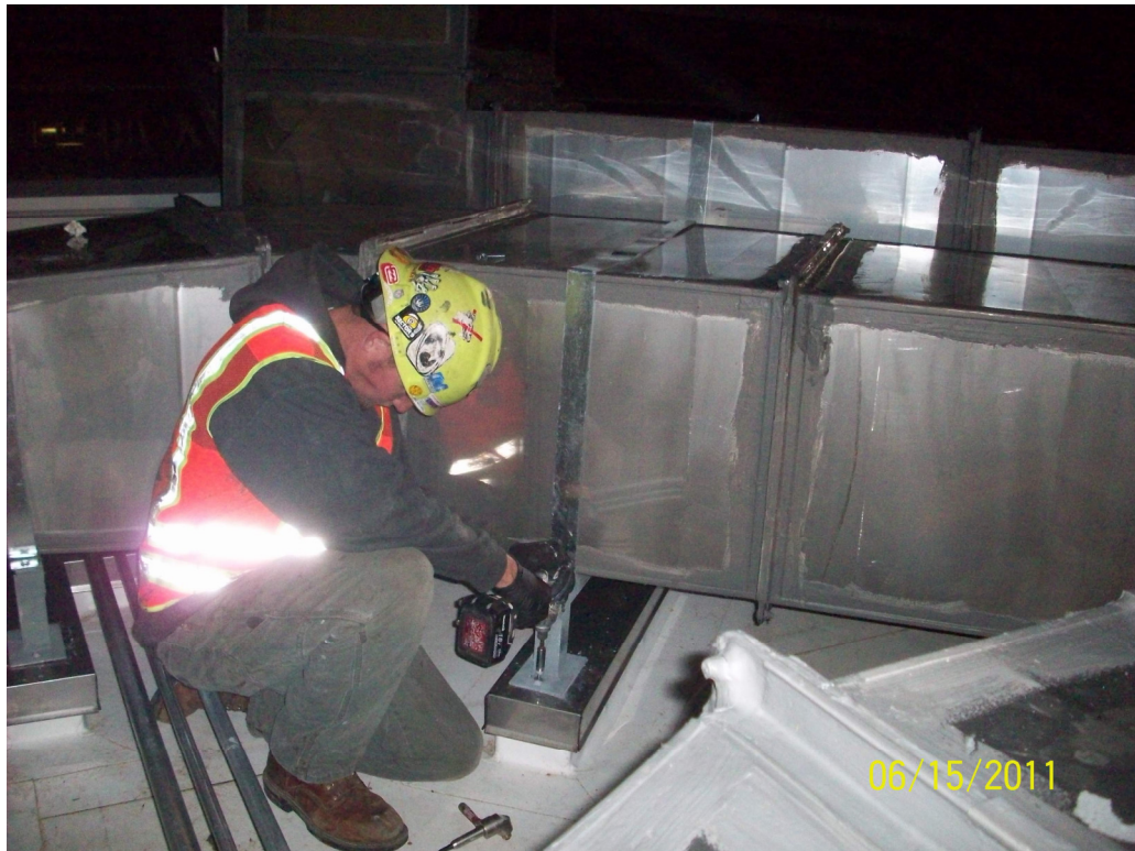
Roof – Installing Ductwork Supports

Notice to Proceed: 02/07/11 Substantial Completion: 06/21/11 (135 calendar days) Original Contract Days: 135 Time Extension Days - Approved: 0 Revised Contract Days: 135 Total Days to Date: 144 Days Past Completion Date: 9 % Completed by Time: 106.7% Original Contract Amount: $1,151,000 Change Order Amount - Approved: $ 0 Current Contract Amount: $1,151,000 Progress Payment Request through 05/31/11: $680,791 % Completed by Contract Value: 59.1%