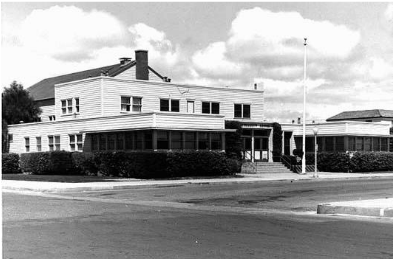
This picture is of old City Hall now the Rec. Center on the corner of Walnut and I St. looking Northeast in the mid 1950's.