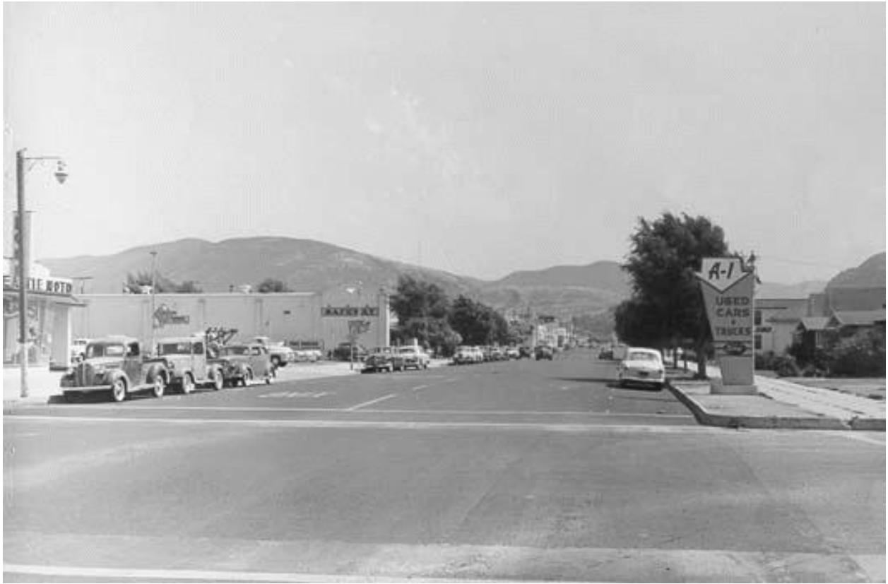
This picture was taken on H St. north of Chestnut Ave. looking south in the mid 1950's.