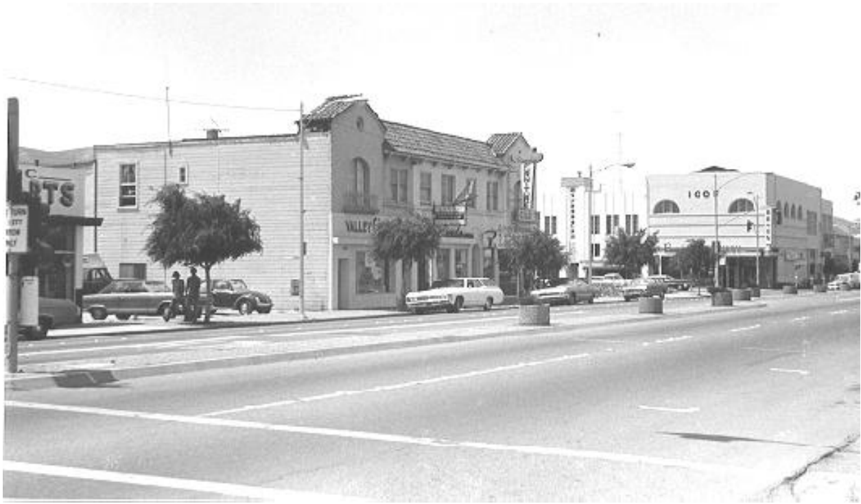
Ocean and H Street early 70's Linde building included furniture store, bar, and hotel