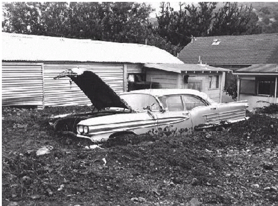
This car was buried by mud and water caused by the collapsed reservoir in the picture above.