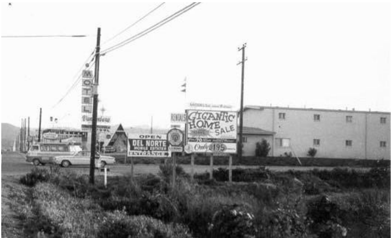
This picture was taken on H St. north of North Ave. looking south in the late 1950's.