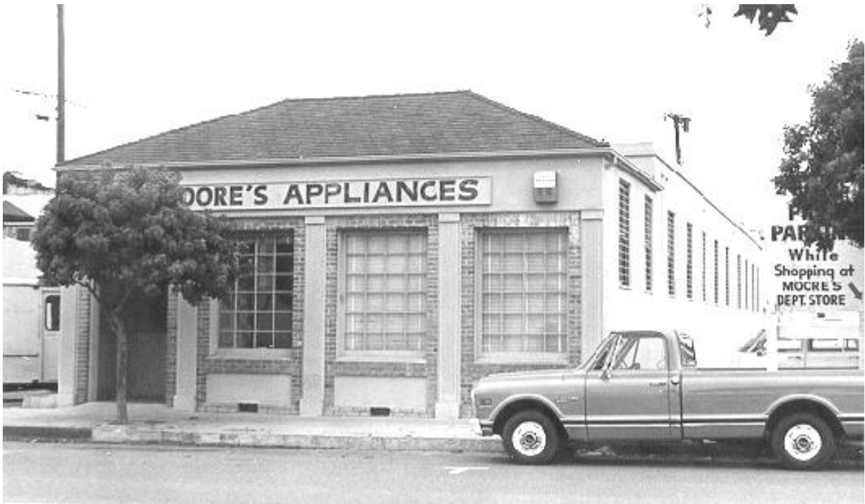
The old Post Office located on South I Street. Home of a US Coast and Geodetic Survey Benchmark