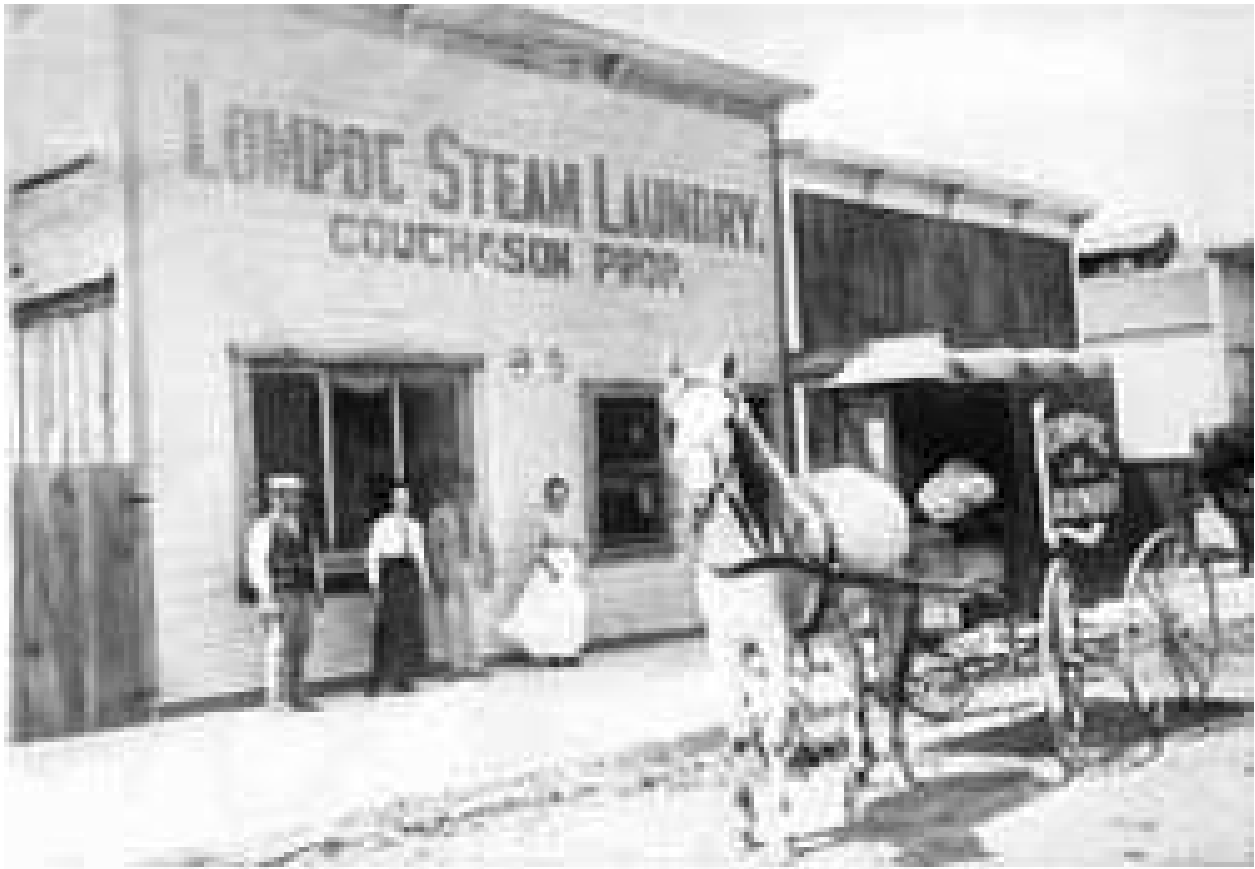
The Lompoc Steam Laundry was on the south side of the 100 block of E. Ocean Ave. (Where Gracian Feed is now). It was later Lafourcade's Dry Cleaning and Laundry