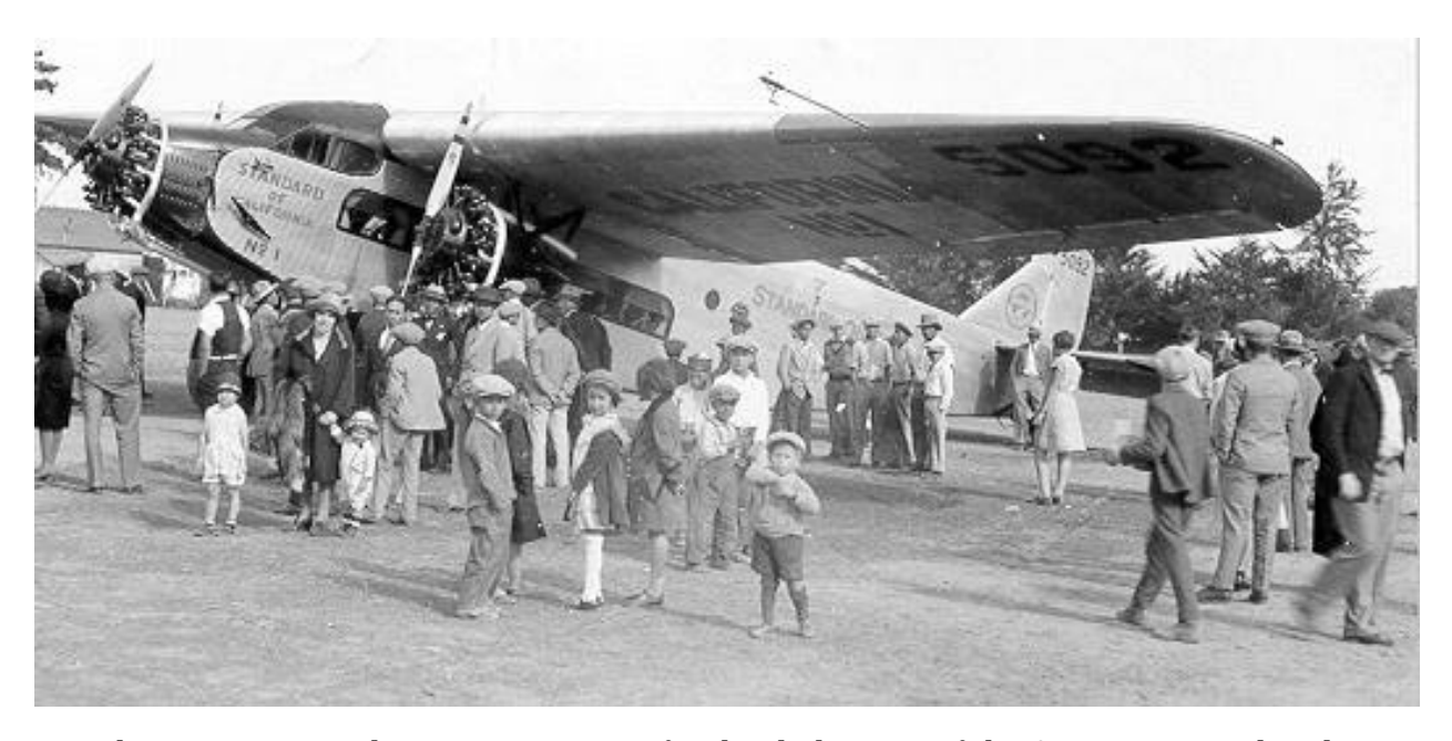
In this picture a Ford Tri-motor present for the dedication of the Airport 1928. The plane was owned by Union Oil Co. and was the biggest plane to land at the Airport up till that time.