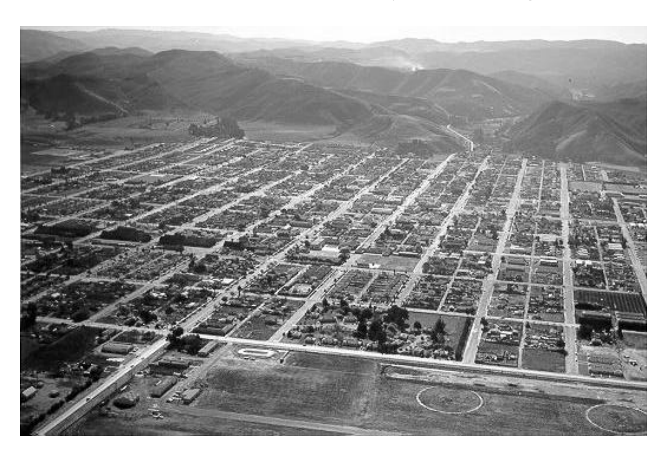
In the air looking Southeast at Lompoc Airport. Note the blimp circles