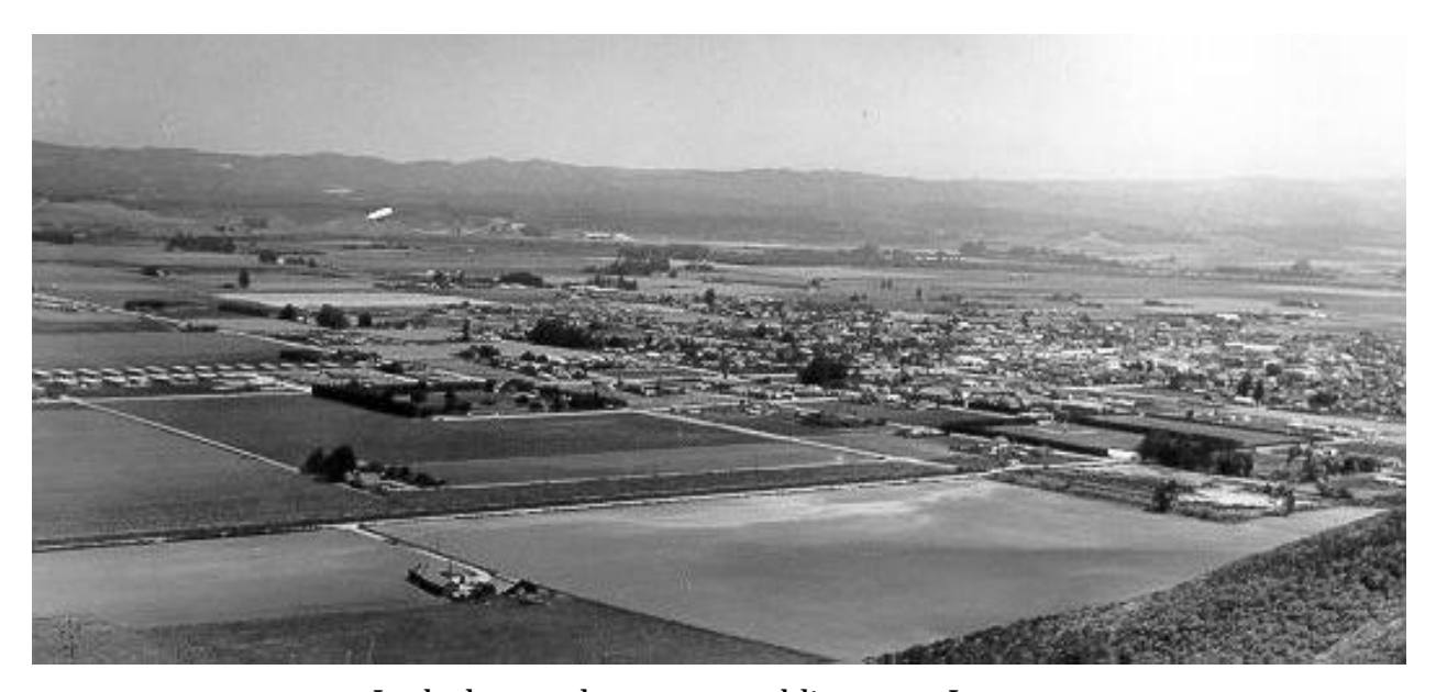
Look close and you can see blimp over Lompoc