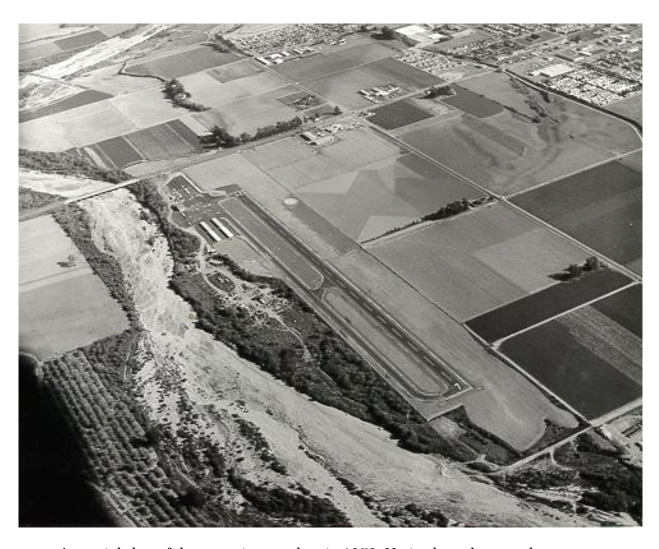
An aerial shot of the new airport taken in 1978. Notice how the town has grown