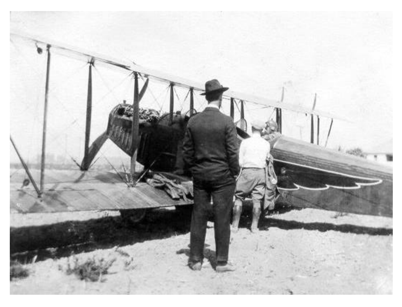
In this picture there is a Curtiss JN-4 "Jenny". It was a war surplus Army trainer plane that could be bought for a very reasonable price.