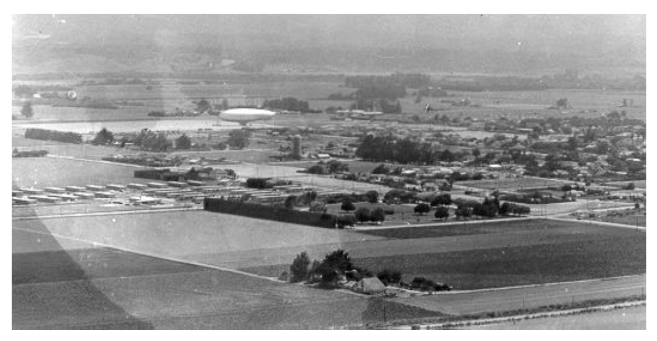
A blimp moored at the Lompoc Airport with Ryan Park in the foreground