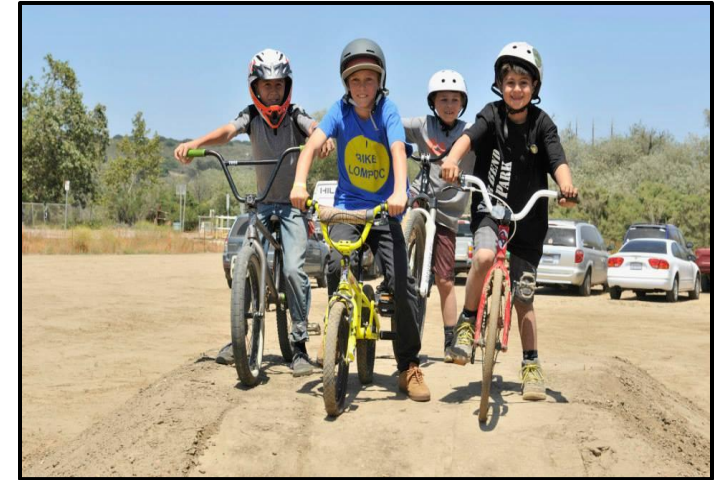
River Bend Bike Park under construction