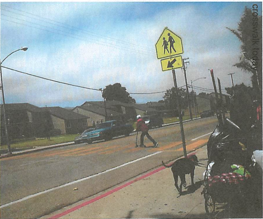
Facing South West 1 College&I with pedestrian in the crosswalk today