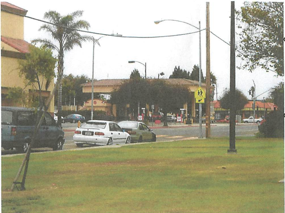
Facing North East College & I