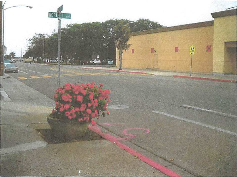
Facing North East 1 College & I, P's